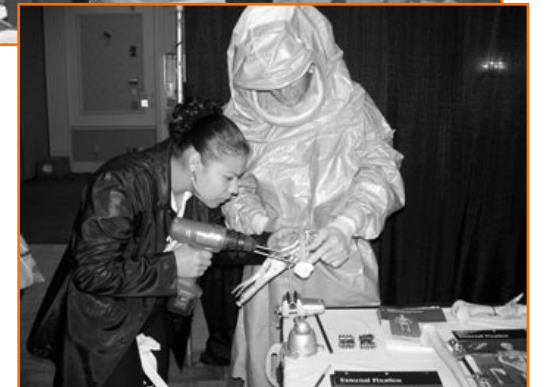
Above: Health Career Pathway Day exposes students to careers available in the medical care industry.

Did you ever wonder what it would be like to pursue a medical career? Fifteen students from North Attleboro High School were given the opportunity to talk with many different health professionals at an event that took place at the Sheraton Colonial in Wakefield on October 5th, 2004. The Sheraton's Conference Center was transformed into a model hospital for a Health Career Pathway Day event that involved over 500 high school students from the Greater Boston area. The purpose of the event was to expose students in high school to the variety of careers available in the healthcare industry.