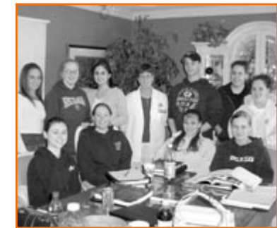
These students participated this past year

This program is a great example of a true collaboration between business and education that will truly meet the needs of the students we serve with this opportunity. Supporting health care initiatives ensures not only that