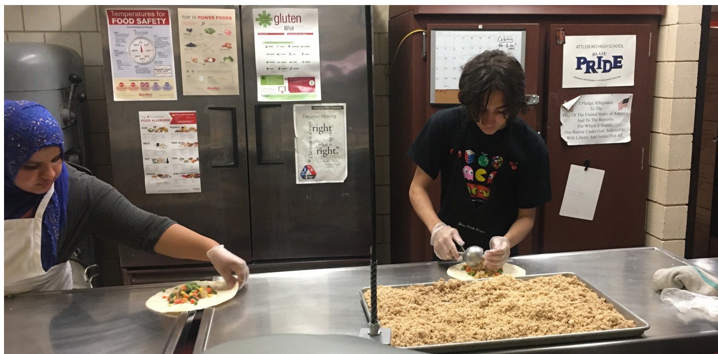
Two Commis Chefs plating some of the many meals prepared for the Soup Kitchen