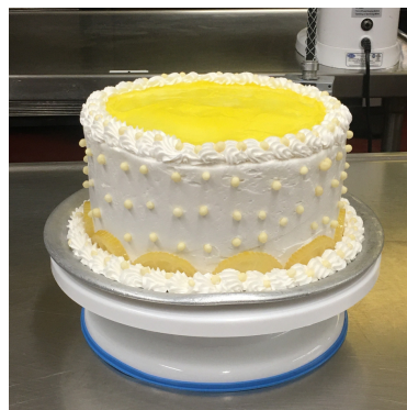
A lemon cake to celebrate the end of our summer program!